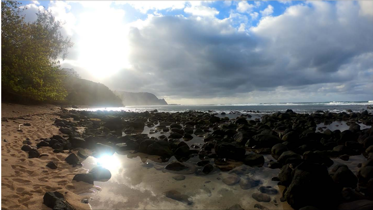
Star Performer - On Top of the World